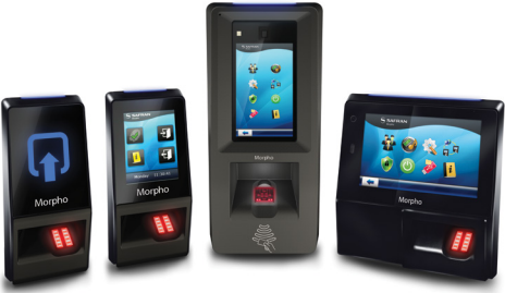
THE SIGMA FAMILY

With the entire SIGMA Family, integrators have a complete range of biometric terminals at their disposal, compatible with each other, to secure any kind of use case scenario – whether indoors or outdoors – with the World's most accurate fingerprint technology.